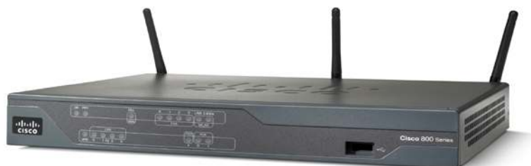
Figure 1. Cisco 861 Integrated Services Router with Integrated 802.11n Access Point