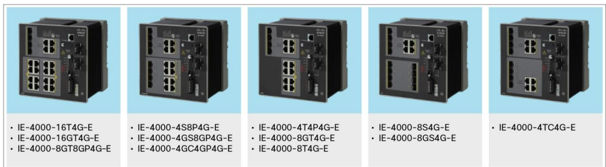
Figure 1. IE 4000 Models

Figure 1 shows switch models, Table 2 shows all the available Cisco IE 4000 Series models, Table 3 list the SW license PIDs and Table 4 lists the power supplies for Cisco IE 4000 Series Switches.