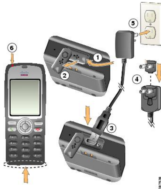
Figure 1: AC Power Supply

The following figure describes how you set up the phone to charge with the AC power supply. The numbers refer to the procedure steps.