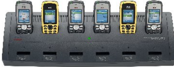
Figure 2: Cisco Unified Wireless IP Phone 7925G Multicharger

For more information, see the Cisco Unified Wireless IP Phone 7925G, 7925G-EX, and 7926G Multicharger Installation Guide .