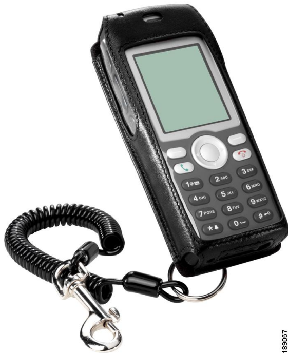
Figure 5: Cisco Unified Wireless IP Phone 7925G Leather Carry Case with Phone

The following figure shows the Cisco Unified Wireless IP Phone 7925G Leather Carry Case. The Cisco Unified Wireless IP Phone 7926G Leather Carry Case is similar, but the bar code scanner of the Cisco Unified Wireless IP Phone 7926G is accessible without removing the case.