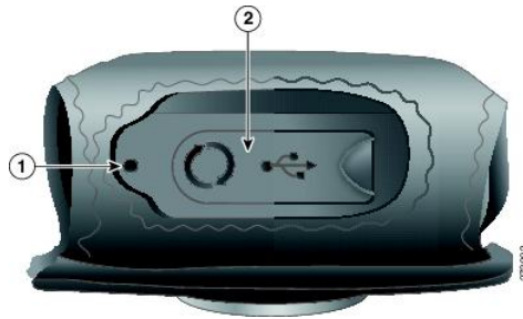
Figure 6: Leather Case Opening for Microphone and Mini-USB Port

The following figure shows the bottom of the phone when in the leather case.