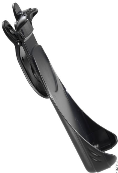
Figure 4: Cisco Unified Wireless IP Phone 7925G Holster Carry Case

The following figure shows the Cisco Unified Wireless IP Phone 7925G Holster Case. The Cisco Unified Wireless IP Phone 7926G Holster Case is similar in appearance, but is shaped differently to accommodate the bar code scanner of the Cisco Unified Wireless IP Phone 7926G.