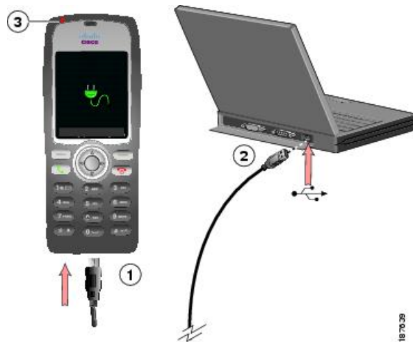
Figure 8: USB cable connecting the phone to a PC

You can use a standard or Cisco USB cable to connect your Cisco Unified Wireless IP Phone 7925G, 7925G-EX, and 7926G to a computer to configure a new phone for the first time or to charge the phone battery. The following figure shows how to connect the phone to a computer.