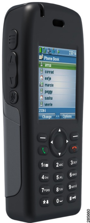
Figure 7: Installed Cisco Unified Wireless IP Phone 7925G Ruggedized Case

Two clips that can attach to the back of case are provided: