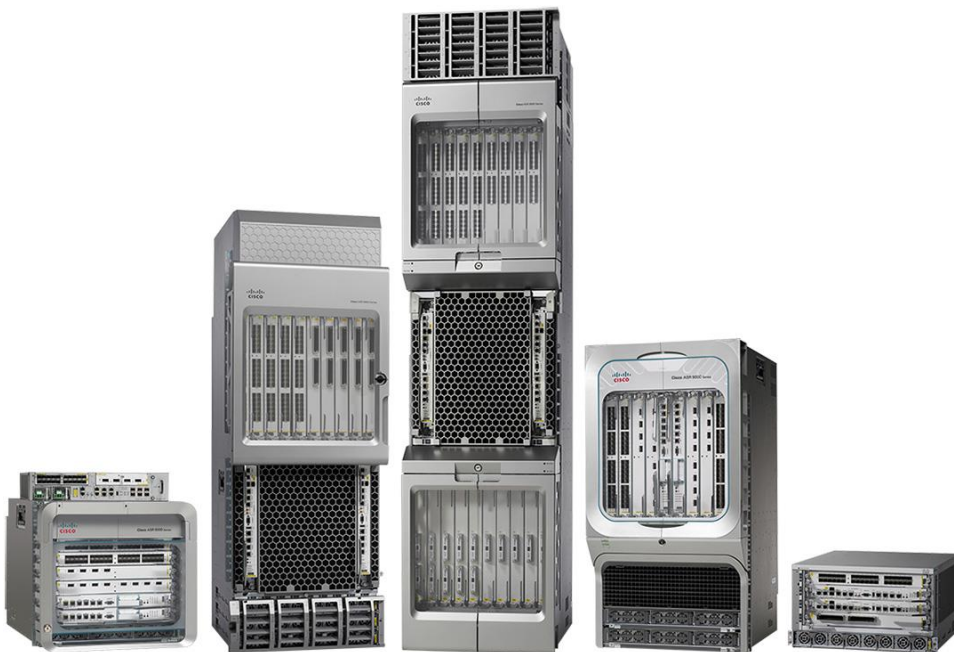
Figure 1. Cisco ASR 9000 System

The Cisco ASR 9000 Series is an operationally simple, future-optimized platform using next-generation hardware and software. The following are highlights of this next-generation platform: