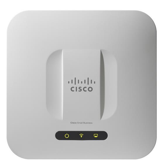
Figure 2. Front Panel of the Cisco WAP551/WAP561 Wireless-N Access Point with PoE