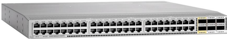
Figure 4. Cisco Nexus 2348TQ Fabric Extender (Port View)

Support for both forward (port-side exhaust) and reverse (port-side intake) airflow schemes is available. Forward airflow is useful when the port side of the switch sits on a hot aisle and the power-supply side sits on a cold aisle. Reverse airflow is useful when the power-supply side of the switch sits on a hot aisle and the port side sits on a cold aisle. The Cisco Nexus 2348TQ has two 1+1 redundant hot-swappable power supplies and three hot-swappable independent fans with support for 2+1 redundancy.