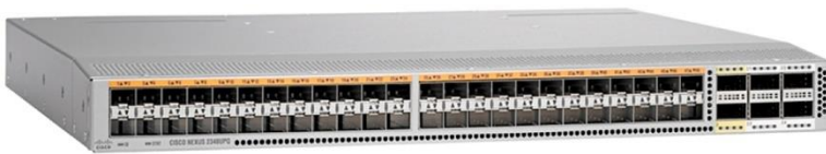
Figure 2. Cisco Nexus 2348UPQ Fabric Extender (Port View)

Support for both forward (port-side exhaust) and reverse (port-side intake) airflow schemes is available. Forward airflow is useful when the port side of the switch sits on a hot aisle and the power-supply side sits on a cold aisle. Reverse airflow is useful when the power-supply side of the switch sits on a hot aisle and the port side sits on a cold aisle. The Cisco Nexus 2348UPQ has two 1+1 redundant hot-swappable power supplies and three hot-swappable independent fans with support for 2+1 redundancy.