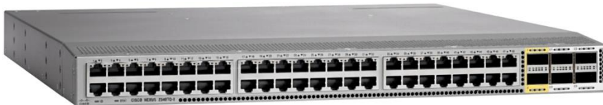
Figure 8. Cisco Nexus 2348TQ-E Fabric Extender (Port View)

Support for both forward (port-side exhaust) and reverse (port-side intake) airflow schemes is available. Forward airflow is useful when the port side of the switch sits on a hot aisle and the power-supply side sits on a cold aisle. Reverse airflow is useful when the power-supply side of the switch sits on a hot aisle and the port side sits on a cold aisle. The Cisco Nexus 2348TQ has two 1+1 redundant hot-swappable power supplies and three hot-swappable independent fans with support for 2+1 redundancy.