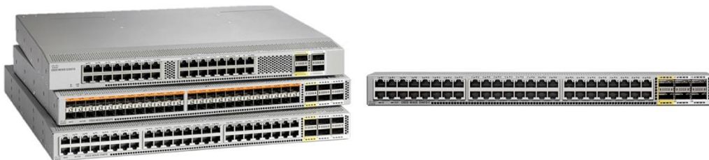
Figure 1. Cisco Nexus 2300 Platform Fabric Extenders: Cisco Nexus 2332TQ (Top Left), Cisco Nexus 2348UPQ (Middle Left), Cisco Nexus 2348TQ (Bottom Left), and Cisco Nexus 2348TQ-E (Right)

The Cisco Nexus 2300 platform provides two types of ports: ports for end-host attachment (host interfaces) and uplink ports (fabric interfaces).