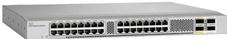
Figure 6. Cisco Nexus 2332TQ Fabric Extender (Port View)

Support for both forward (port-side exhaust) and reverse (port-side intake) airflow schemes is available. Forward airflow is useful when the port side of the switch sits on a hot aisle and the power-supply side sits on a cold aisle. Reverse airflow is useful when the power-supply side of the switch sits on a hot aisle and the port side sits on a cold aisle. The Cisco Nexus 2332TQ has two 1+1 redundant hot-swappable power supplies and three hot-swappable independent fans with support for 2+1 redundancy. Colored handles on each fan or power supply clearly indicate the airflow direction, as shown in Figure 7.