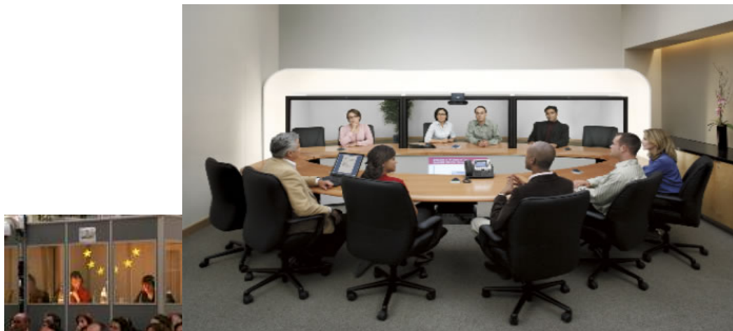
Figure 1. Cisco TelePresence Room with Image of Remote Booth for Interpreters

Most large financial institutions have started to deploy telepresence to enhance collaboration, accelerate decision-making, and reduce the time and costs of travel for executives. Governments and regulatory agencies have so far been slow to adopt, although the Basel-based Bank for International Settlements (BIS) recently installed some units and leaders of the Australian and Italian governments have also expressed strong interest.