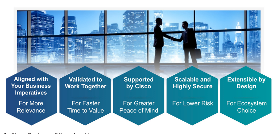
Figure 2. Cisco Business Offers Are About You

For more information about successful realworld implementations and best practices, visit: www.cisco.com