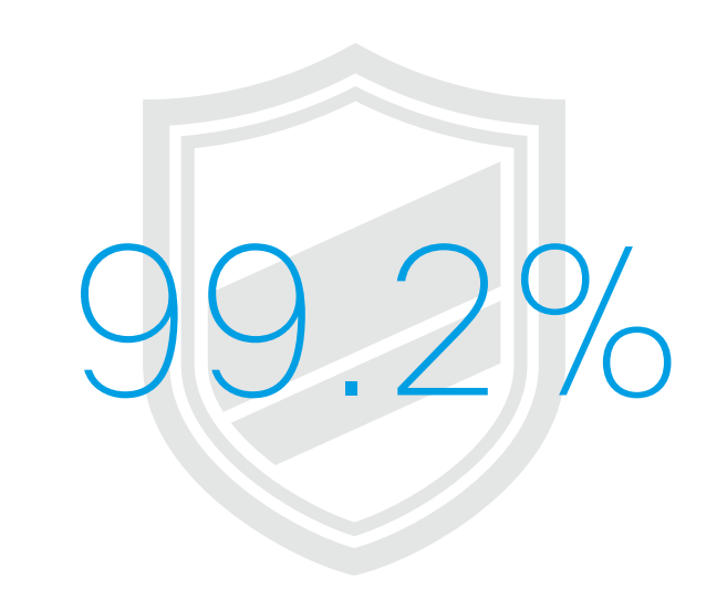
Cisco's Digital Network Architecture delivers 99.2% breach protection.1