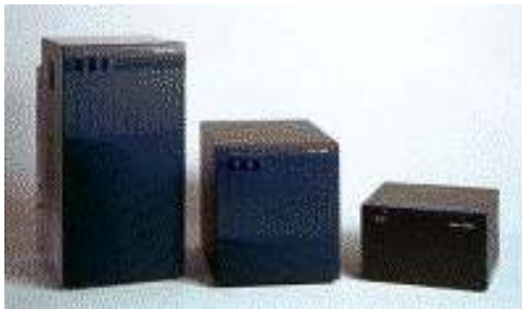
Figure 1. Cisco 7500 Series Router

The Cisco ® 7500 Series router is the premier Cisco distributed services, multiprotocol platform, now with twice the performance and enhanced high-availability (HA) features. The Cisco 7500 Series combines proven Cisco software technology with exceptional reliability, availability, serviceability, and performance features to meet the requirements of today's most mission-critical networks. The Cisco 7500 Series router provides service provider and enterprise networks with the flexibility they need to meet the constantly changing requirements of their networks. The three models of the Cisco 7500 Series allow users to choose the exact configuration needed to optimize installations and network designs for cost and functionality.