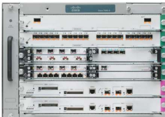
Figure 1. Cisco 7606-S Chassis

With a forwarding rate of up to 240-Mpps distributed and 480-Gbps total throughput, the Cisco 7606-S provides performance and reliability with options for redundant route processors and power supplies. The inclusion of two Gigabit Ethernet ports on the Cisco Catalyst® 6500 Series Supervisor Engine 720 with the Multilayer Switch Feature Card 3 (MSFC-3) or the new Cisco Route Switch Processor 720 (RSP 720) with the MSFC-4 used in the Cisco 7606-S eliminates the need for a line-card slot for uplink ports. The result of this design is more efficient use of available line-card slots and increased deployment flexibility. Four Gigabit Ethernet ports are available for use in dual-route processor configurations.