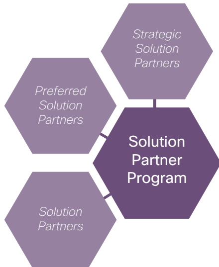
Figure 1. Solution Partner Program

The Cisco® Solution Partner Program will help you integrate your solutions with Cisco's world class architectures and technologies and navigate the increasingly complex world of selling and delivering integrated solutions to customers.